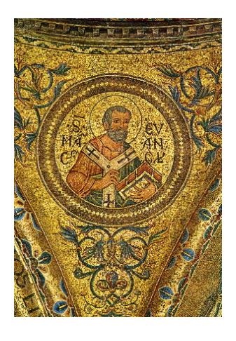
3. Sharing with people who had never met Jesus!